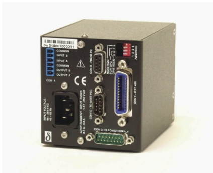
External PSC module