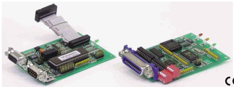
Internal PSC card