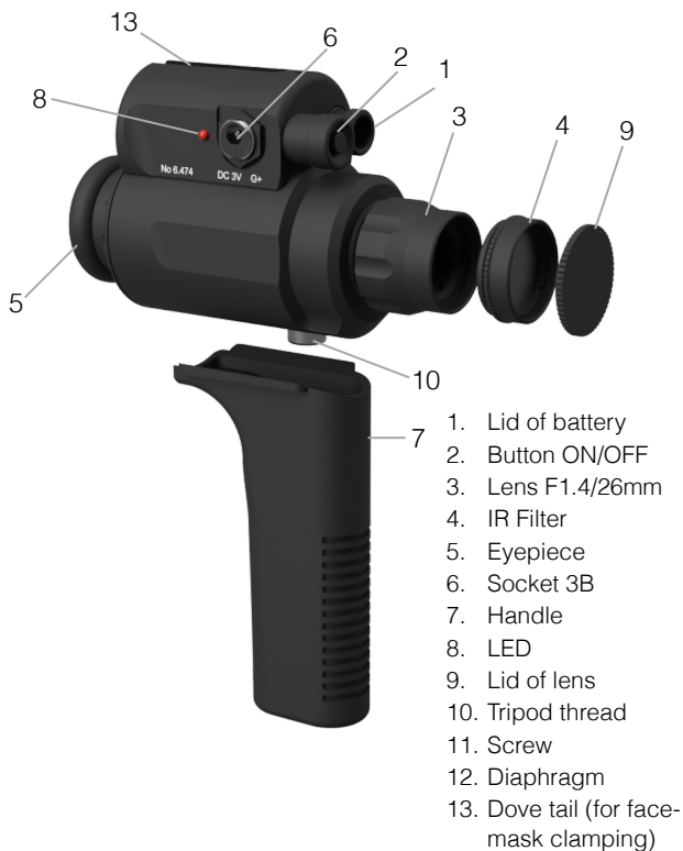
Figure 1. ABRIS M viewer