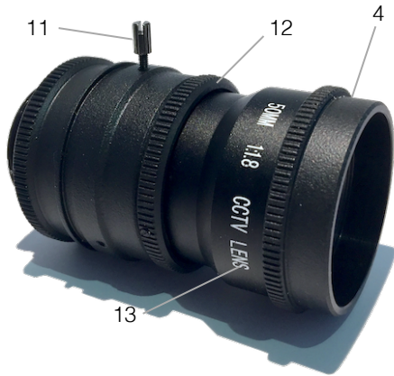
Figure 2. Lens F1.8/50mm