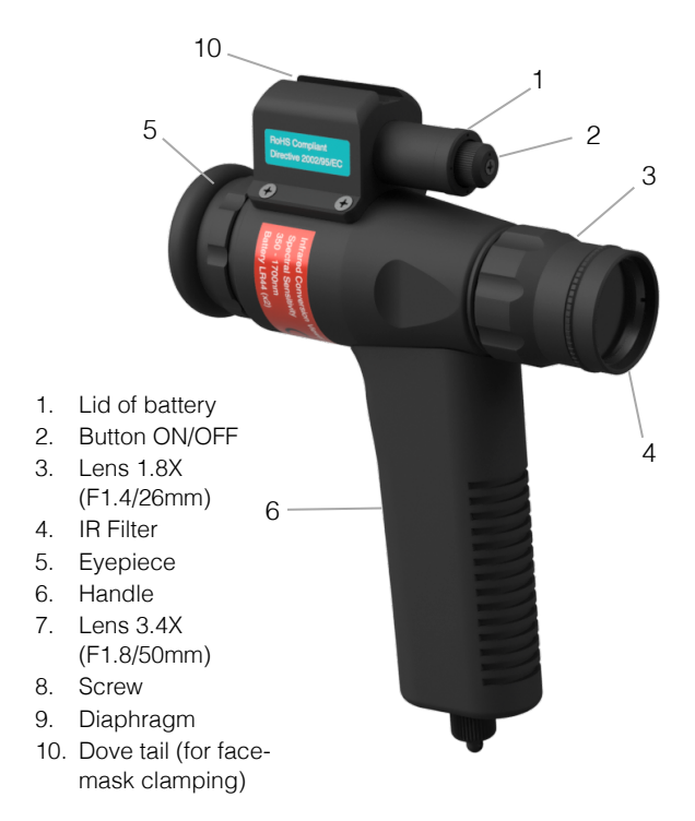
Figure 1. SM-3R Infrared viewer

6. For "goggle" operation, place the IR viewer onto "dove tail" (10) of face-mask and clamp it with screw. Adjust the position with fixing screws for the most convenient operation.