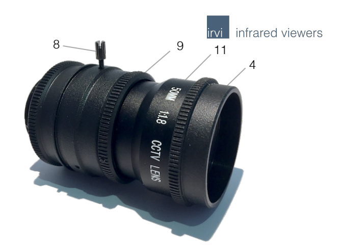
Figure 2. Lens F1.8/50mm (7)